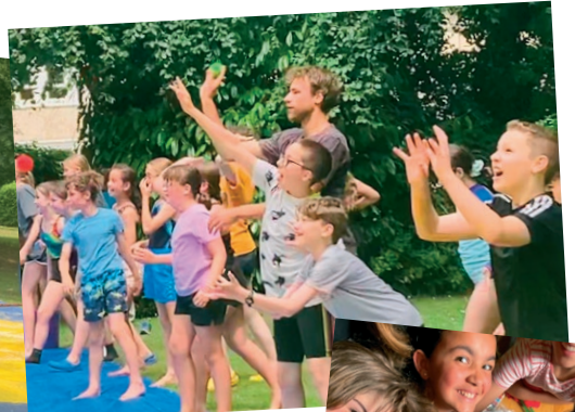
Our last 678 residential at Felden!