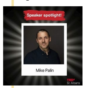
Privileged to have been chosen to speak at TEDx St Albans